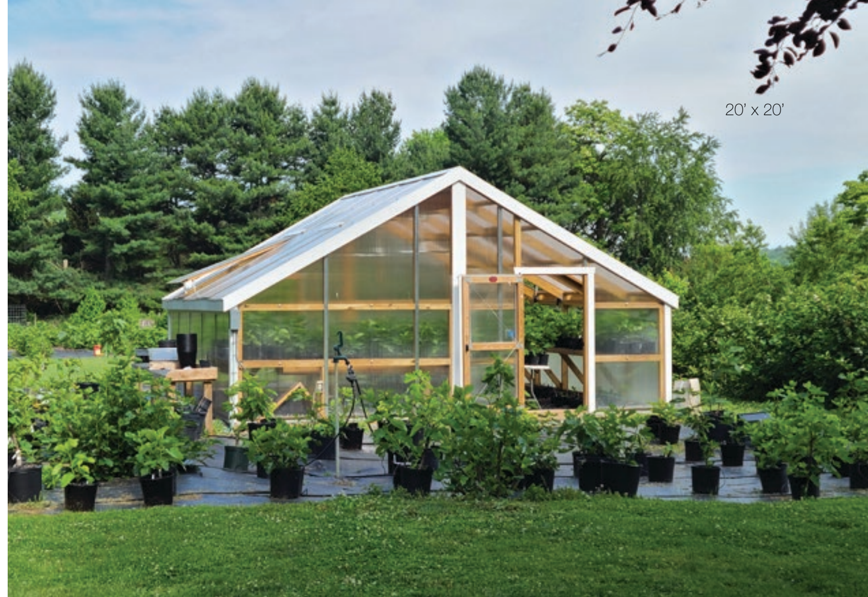
20' x 20'