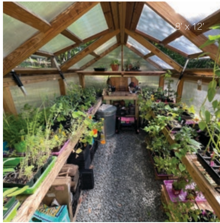
8' x 12'