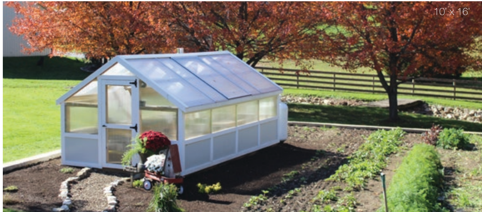
10' x 16'