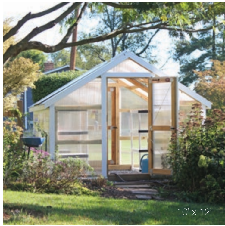
10' x 12'